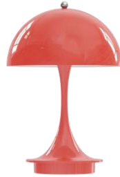
Coral Opaque shade