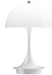
White Opal shade