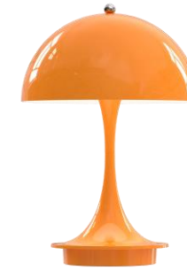
Orange Opaque shade

Diffuser: Injection moulded opal polycarbonate.