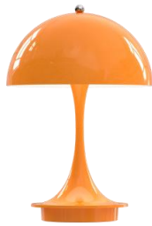
Orange Opaque shade