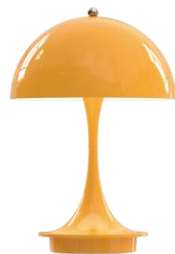
Yellow Opaque shade