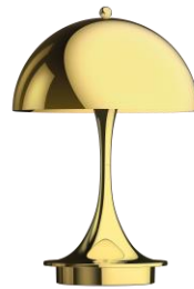
Brass metallized shade