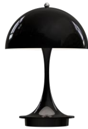
Black Opaque shade