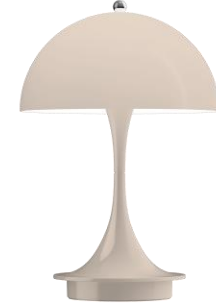
Beige Opal shade/chrome