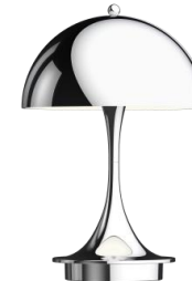
Chrome Metallized shade