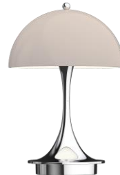
Beige Opal shade/chrome