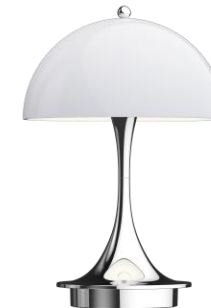
Blue Grey Opal shade/chrome