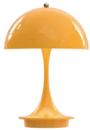
Yellow Opaque shade