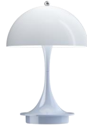
Pale Blue Opal shade