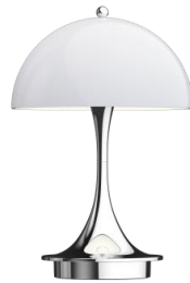
Blue Grey Opal shade/chrome