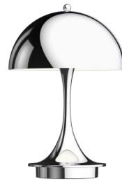
Chrome, metallized shade