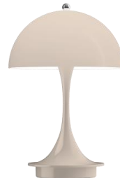
Beige Opal shade