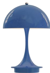
Indigo Blue Opaque shade