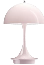
Pale Rose Opal shade